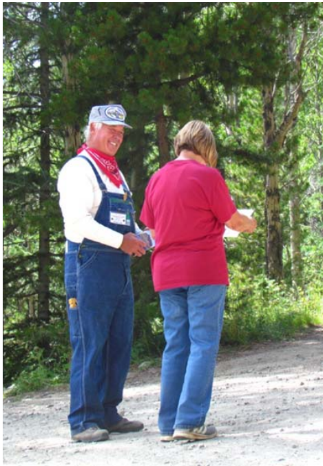
Boreas Pass Railroad Day, 2015