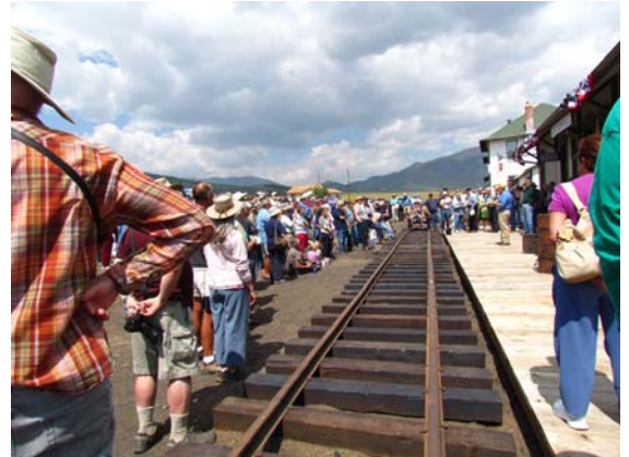
Boreas Pass Railroad Days, 2015

22 th Annual Boreas Pass Railroad Day, August 19th, 2017