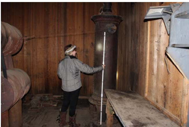
Measuring for a 1/2 scale model, Fall 2016