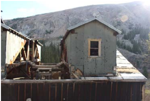
West Wing Dormers, Paris Mill c.2013

Construction was completed this past September, 2016. With many people curious to learn what has been happening at the site, but unable to see the details because this is a closed off construction zone- we wanted to share as many photos and as much information as we can of the progress at Paris Mill.