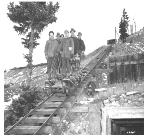
London Butte, date unknown