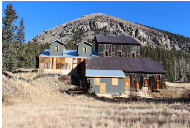
After summer construction, Paris Mill

The South Wing Extension (gold precipitation wing) was