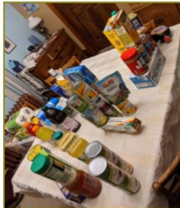
Example overview of food of 14-Day Meal Kit